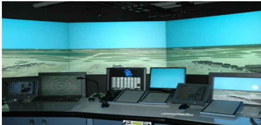
Figure 2. Picture of a Tower Cab Simulator

By using simulators, controllers gain inherent knowledge of a particular airport, its airspace, and application of air traffic procedures for that specific location. The simulators also have a function that writes software for additional airports; this allows controllers from surrounding facilities to utilize the simulators as well.